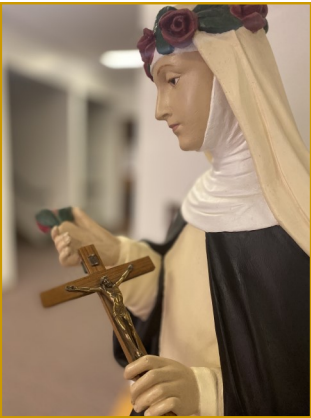
St. Rose Pray For Us!

Senior Center: The Senior Center is in need of volunteers to help at the center. They need help from 9:00am until 1:30pm.