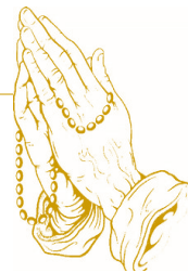
Lord Hear Our