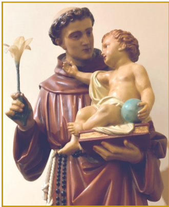
St. Anthony Pray For Us!