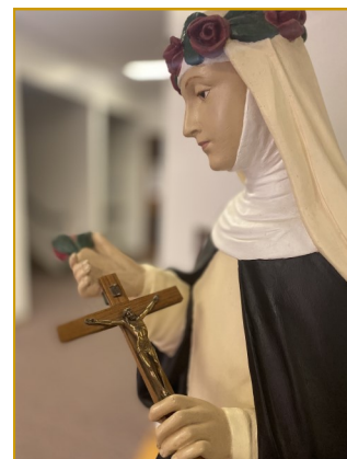
St. Rose Pray For Us!